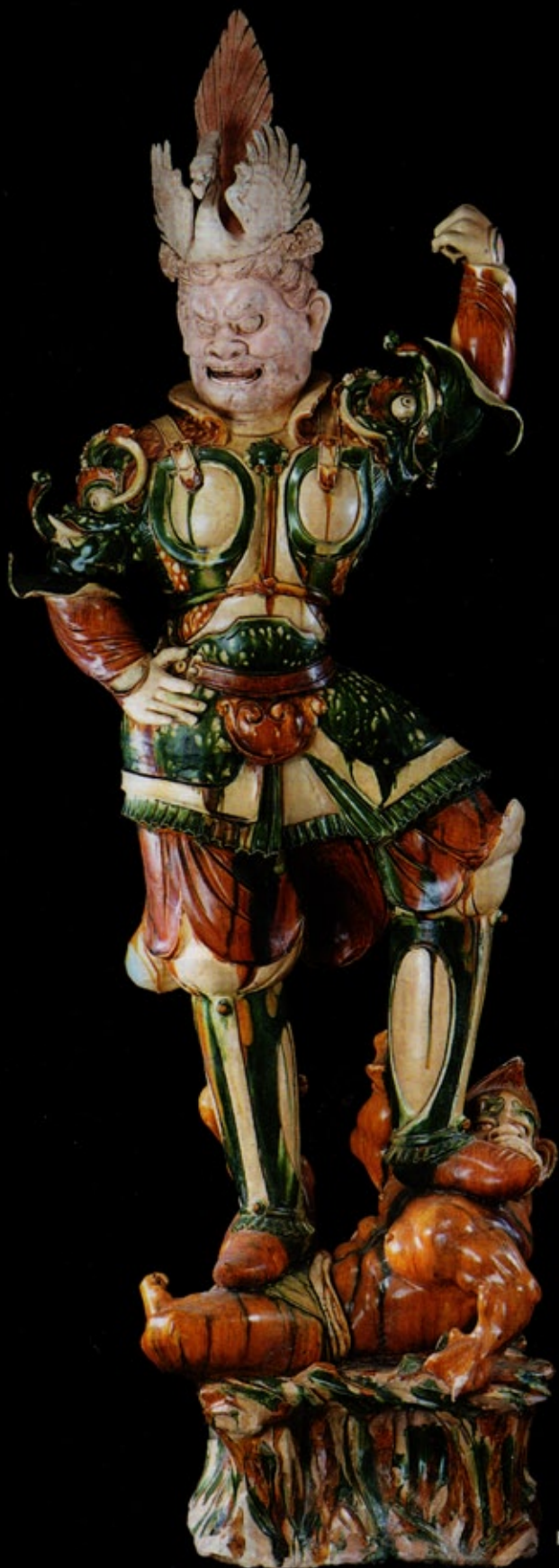
Height 4' 8"