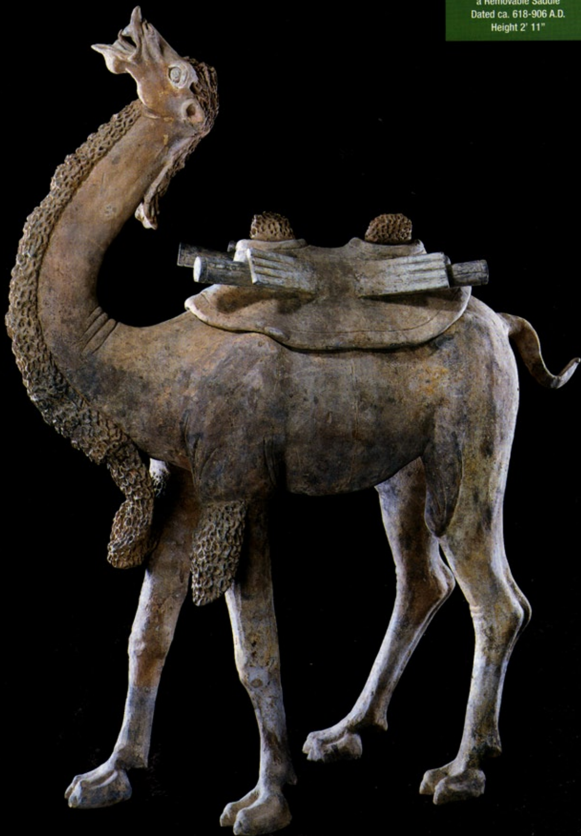
T'ang Large Camel with a Removable Saddle Dated ca. 618-906 A.D. Height 2' 11"