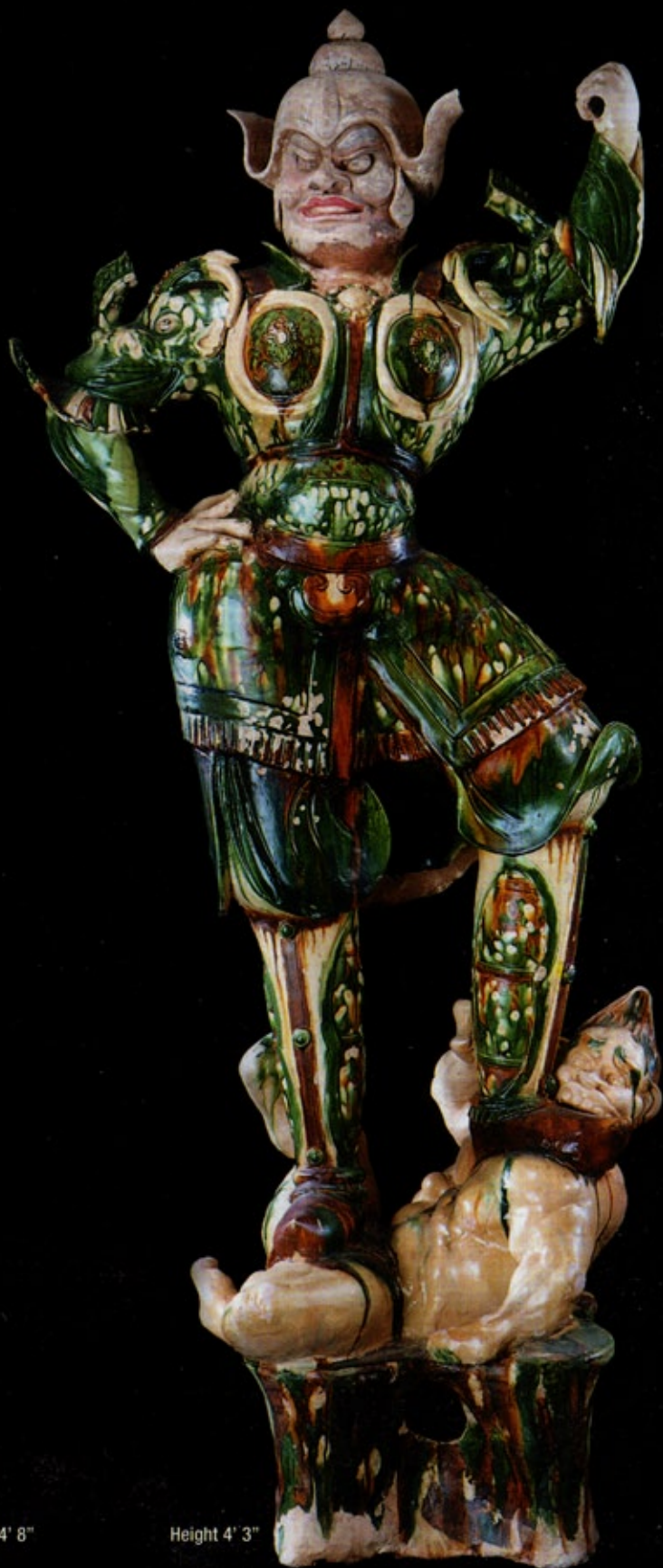
Height 4' 3"