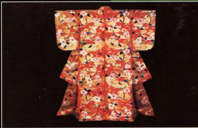
Karaori with Snow-laden Camellias and Genji Clouds, Edo period, 18th century. Multicolored silk and gold-leaf paper supplementary weft patterning on silk twill. On display at the Los Angeles County Museum of Art