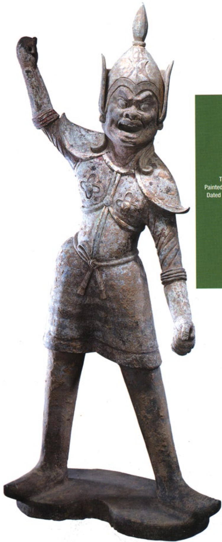
T'ang Pair of Painted and Gilt Warriors Dated ca. 618-906 A.D. Height 3'

For this is a city that will support whatever extraordinary efforts it takes to acquire the world's most important historical artifacts, much to the