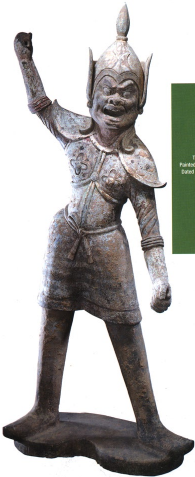
T'ang Pair of Painted and Gilt Warriors Dated ca. 618-906 A.D. Height 3'

For this is a city that will support whatever extraordinary efforts it takes to acquire the world's most important historical artifacts, much to the