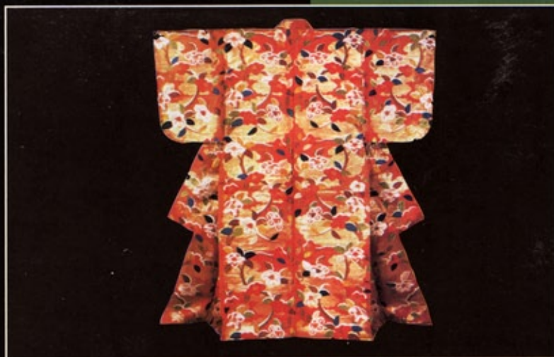
Karaori with Snow-laden Camellias and Genji Clouds, Edo period, 18th century. Multicolored silk and gold-leaf paper supplementary weft patterning on silk twill. On display at the Los Angeles County Museum of Art